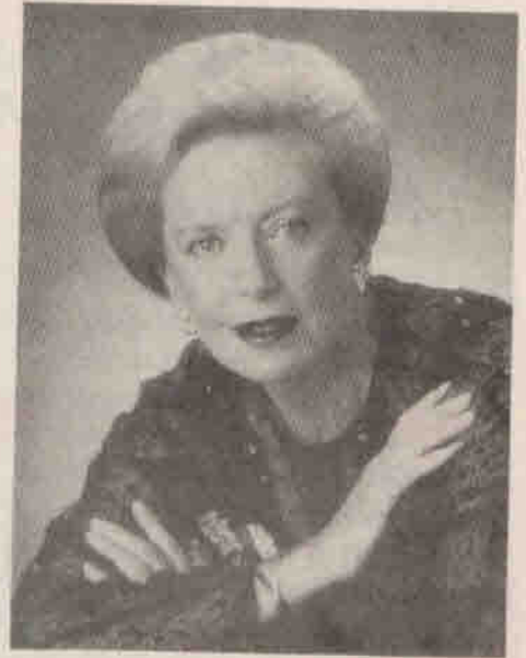
Deborah Kerr to promote Timeless.

(Explanation of illustration 3 will appear in the December issue)